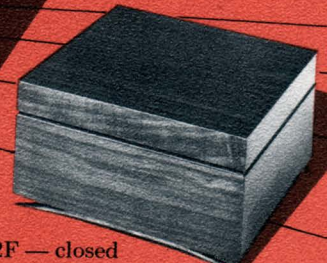
Model 612F — closed